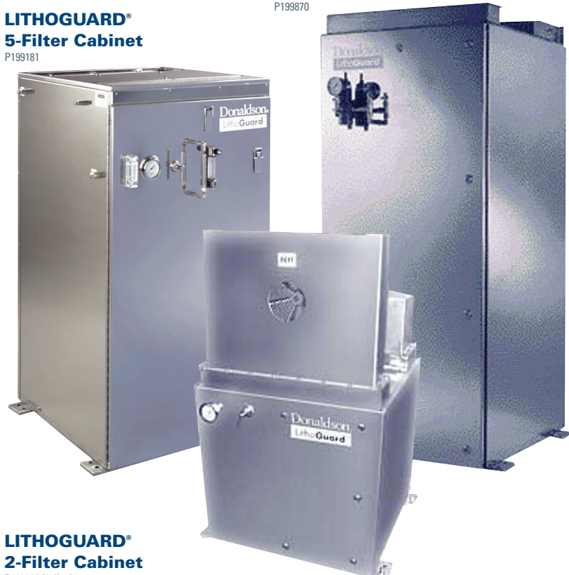
LITHOGUARD® 7-Filter Cabinet P199870